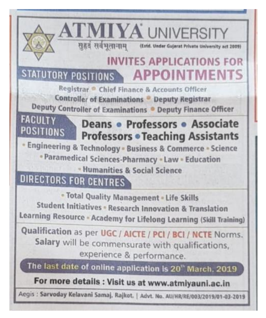
Times of India – 6-3-2019 – All India Editions